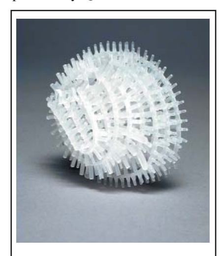
#2 NUPAC® US Patent #5,498,376 Worldwide patents pending

Had a 14 ft diameter tower, with over 3,000 ft³ of packing been required, the cost of the project would have easily been 35% - 40% higher vs. the Lantec Products design.