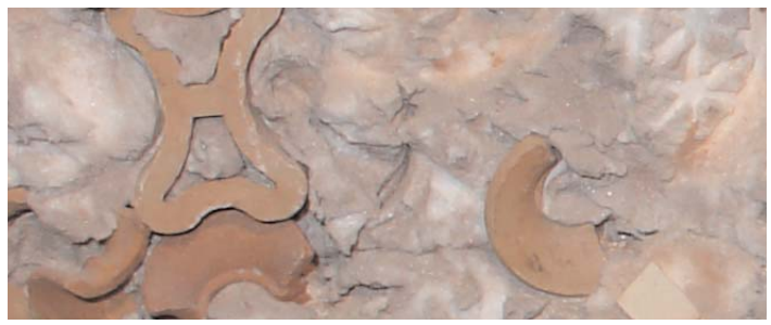
History of random media preserved in insulation.

The Chicago plant had an additional problem. Due to the high VOC content of the air being treated, the RTO had been designed to operate in autothermal or selfsustaining combustion mode, so the heat recovery canisters in this RTO are shallow. The desired thermal efficiency was 80%, so the RTO was designed to operate with 2.5 ft of 1" ceramic saddles in each of the three heat-recovery canisters. It proved impossible to recover this much heat because the random-dumped