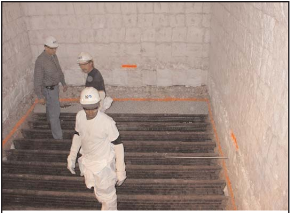
25-mm ceramic balls installed according to wall markings indicating proper level of balls and MLM®