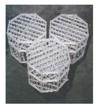
Figure 1. Q-PAC from Lantec Products:

An existing ClO<sub>2</sub> (chlorine dioxide) scrubber tower at a pulp mill was repacked during a planned maintenance shut down. As the result of replacing 3" Kynar and 2" CPVC Norton Super Interlox saddles with Q-PAC from Lantec Products, the scrubber tower is now operating at a greatly reduced pressure drop compared to when the tower was packed with saddles. The reduced pressure drop has resulted in a significant power savings for mill. Immediate savings of over $80,000 per year in reduced power cost has been realized by the mill. The ClO<sub>2</sub> emissions from the scrubber to the atmosphere are also now below detection level with Q-PAC in service in the tower.